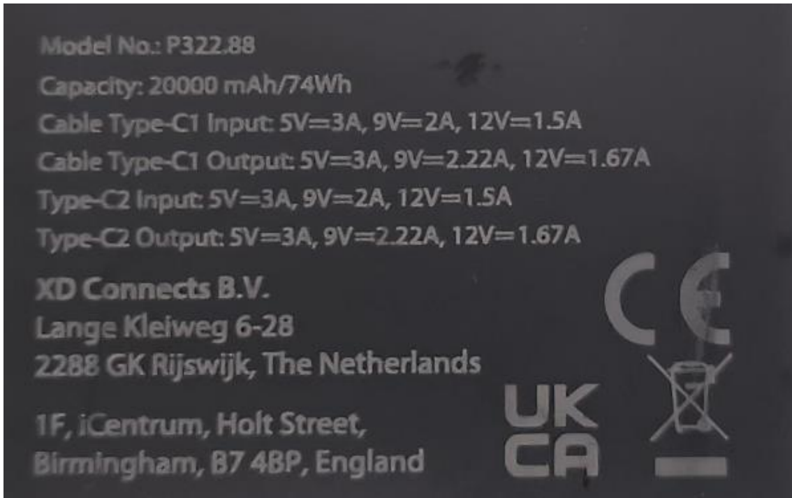
Fig.5 – Label view of Battery