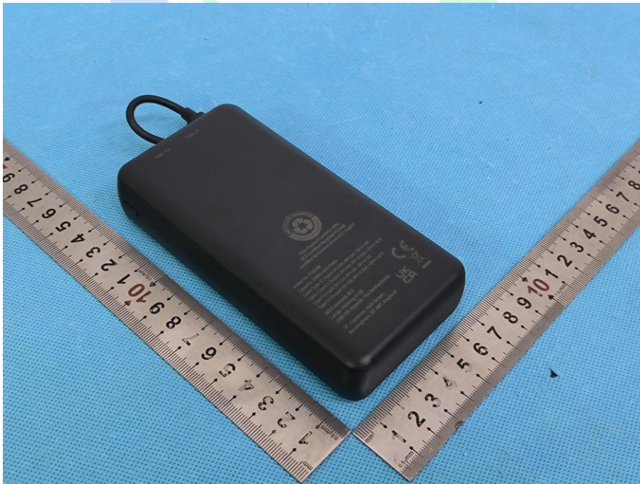
Fig.2 – Back view of Battery