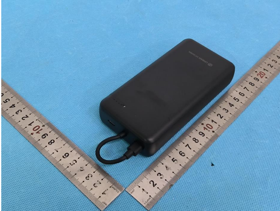
Fig.1 – Front view of Battery